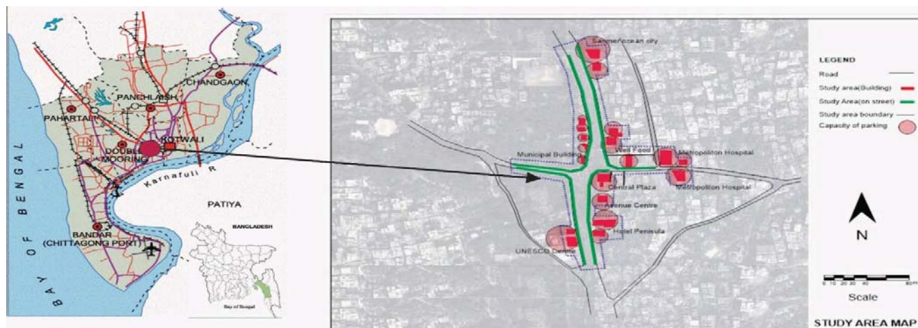
Fig. 1 Study area map