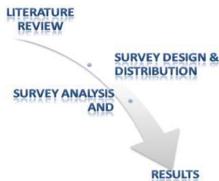
Fig. 1 Project methodology process

The methodology followed in this paper will be presented. Fig. 1 illustrates the systematic process used in this research. This study has adopted qualitative research technique by first; establishing a draft list of 83 delay factors collected from literature review, the number of factors was revised based on discussions with industry experts and a recommendation of 42 factors were taken into account in the study. To identify the influence of delay factors affecting the construction industry, a quantitative procedure was adopted by developing a survey questionnaire, and applying analysis to the survey data using statistical methods, which will be discussed in the sections below.