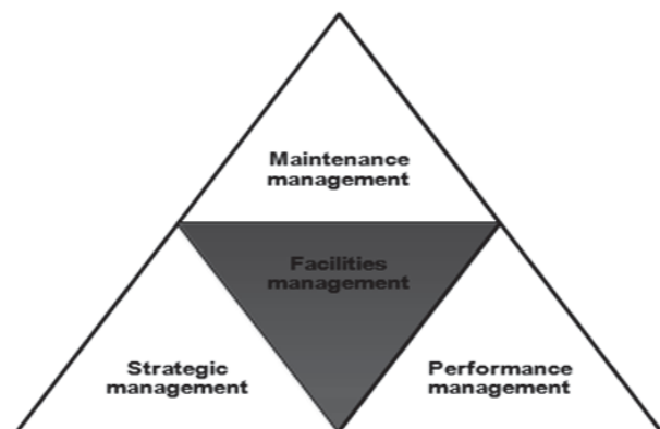
Fig. 1 Maintenance management in the context of facilities management

organisation to enable sustenance and further development of essential services that support and improve the effectiveness of the primary activities of the organisation. However, facilities management as a multidisciplinary function encompasses all functions that relate to asset management [2]. It is a key function in the management of resources, support services and the built and work environment, acting as a major support function for the core business of an organisation. It has a major impact on the success of the organisation, because it covers a wide range of services and management. It also deals with building performance issues; hence, performance management is a core function in the context of facilities management [2]. Facilities management is a major function that encompasses all property related functions and supporting activities, of which maintenance, performance and strategic management are three of the numerous functions [2], [3].