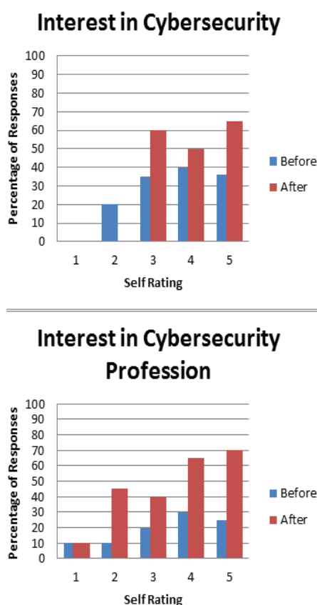
Fig. 1 Student's self-ratings in various aspects of cybersecurity

Cybersecurity competitions teach students current techniques and tools in network security and also allow them to engage in local, regional, national, and international competitions where they will have the opportunity to test their skills in realistic scenarios, similar to those that exist in the private or public sector. Ronald states ...all students who participated in the study benefited greatly from the CBL experience. These benefits included knowledge gained by networking with industry professionals, improving computer and security skills, and applying these skills in a practical, real world environment [6].