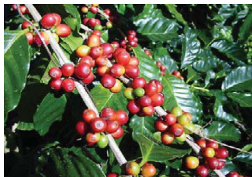
Fig. 1 Coffee Plant

grows at higher altitudes [5]. In the food industry, fruits (berries), which are some parts of the coffee plant, are used for the production of coffee [6]. A typical coffee plant can be seen in Fig. 1. 70 different species of genera Coffea are being reported but most important are Coffea arabica (arabica coffee) and Coffea canephora (robusta coffee). These two varieties differ in their taste, appearance, and between caffeine contents. A hedonic trend of consumers falls in favor of Arabica coffee as compared to Robusta coffee [5].