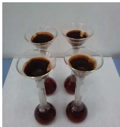
Fig. 3 Filtered coffees

Perkin-Elmer Optima 2100 DV model ICP-OES equipped with an AS-93 auto sampler was used in the experiments (Fig. 4).