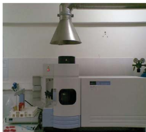
Fig. 4 Perkin-Elmer Optima 2100 DV, ICP-OES

Measurement conditions were adjusted to a power of 1.45 kW, plasma flow of 15.0 L min -1 , auxiliary flow of 0.8 L min -1 and nebulizer flow of 1 L min -1 .