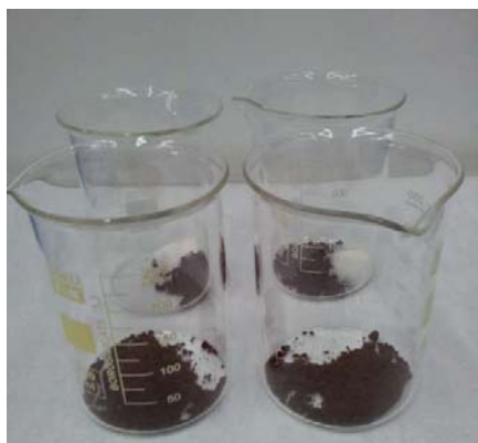
Fig. 2 Coffee Samples

Turkish coffees were purchased from the local market in Istanbul, Turkey (Fig. 2).