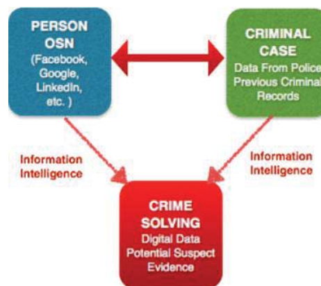
Fig. 1 Top layers of SC-Ont Ontology

This review and discussions with the police and attorneys in Albania have given us the knowledge and the basis to design the initial version of the SC-Ont ontology. We have perceived the ontology as having three main pillars: People, Crimes and Crime Solving as illustrated in Fig. 1.