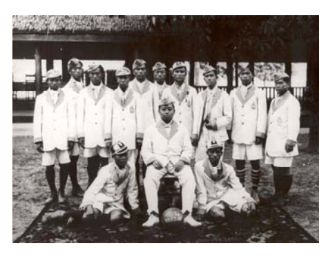
Fig. 4 King Rama VI and the football team [10]

Another activity designed to train men to have gentlemanly behavior was battle exercising and sports competition among members of the Scouts with the purpose of creating unity among members due to His Majesty's initiation about the lack of unity among civil servants [9]. The Scouts was established to serve the king's initiation to solve the problem by requiring the civil servants of all departments to come together to have battle exercises. The successful outcome of this activity was the elimination of the sense of divide among different levels of officials from different working units. Since every member had to respect commander of each level, and His Majesty was commander in chief, this resulted in the acquisition of being loyal and nationalism.