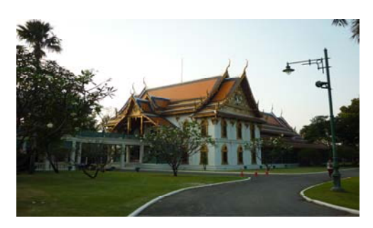
Fig. 2 The traditional Thai style building [2]

Thai art in terms of its appearance and its concept deriving from the belief of Tri-phases including planning, shape and elements. However, later on King Rama VI had an initiation to rehabilitate traditional Thai architecture and art.