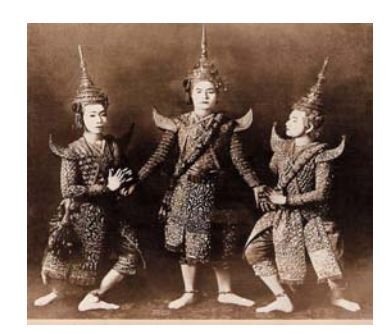
Fig. 1 The traditional Thai performing art [1]