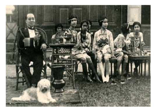
Fig. 5 Women's participation in social activity [11]

The analysis results of King Rama VI's initiation in terms of art and culture disclose the relevance of the theory of modernization especially the state of being up to date in line with western countries. For example, during the flashback of the popularity of traditional handicraft in western countries, in Thailand there was also flashback of the rehabilitation of traditional Thai art and culture to show the national identity and the prosperity of Thai culture, which has been passed on recently. In terms of the definition of culture under the conceptual framework of European Empire Period, since culture was defined as modernization or westernization, Thailand had to show its high standard of culture in accordance with western criterion by creating art and cultural artifacts based on western value and by implanting the practice of gentlemanly behavior among the citizen. Meanwhile, the support of Thai women's status in accordance with that of western countries was also implemented by the change of Thai men's misconception concerning multiple marriage life with more than one wife, the superior of Thai male over female, and the encouragement of women's participation in social clubs and formal school education.