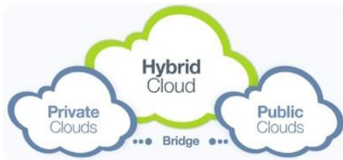
Fig. 1 Graphical model of 3 cloud system types and the relationship between them [31]

model can be separated into two types, service and deployment [34].