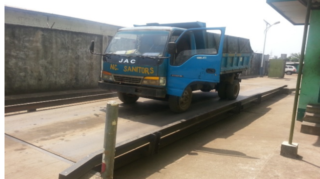
Fig. 5 Transportation of healthcare waste in Liberia