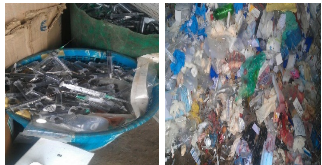
Fig. 1 Waste generated by facilities