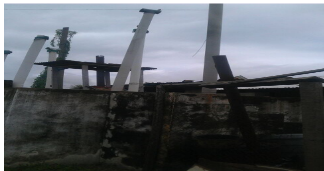
Fig. 6 Side view of the Burial pit

Landfilling was the most commonly practiced disposal method of healthcare waste at the three surveyed facilities. Burial pit was used for disposal of body parts that were generated from surgical procedures. The location of the burial pit is situated within a close proximity of the facility. In addition, the burial of other putrescible was done at the landfill situated in Whein town. However, it was found that incineration of waste was done under low temperature, which resulted in lapses as there was incomplete combustion of waste as well as inadequate disposal of the ash. This however poses threats to public health and the Environment. On the other hand, all health facilities dispose of waste along with domestic waste in an open dump site outside the city. These wastes were randomly mixed together and was then buried or incinerated. The public health Law of Liberia 1976, The Environmental Protection Law of Liberia, The Ministry of Health Division of Environmental and Occupational Health all have mandates to conduct sanitary inspection, evaluate compliance with the public health law on the management of medical waste, up till present there are no guidelines or standards on healthcare waste handling and management.