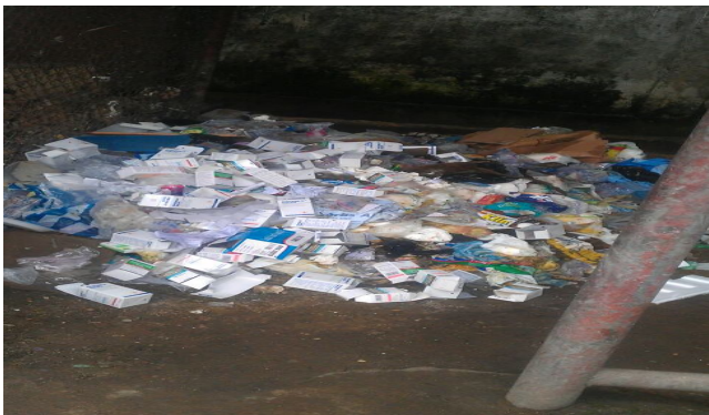
Fig. 3 On- site Storage at a facility