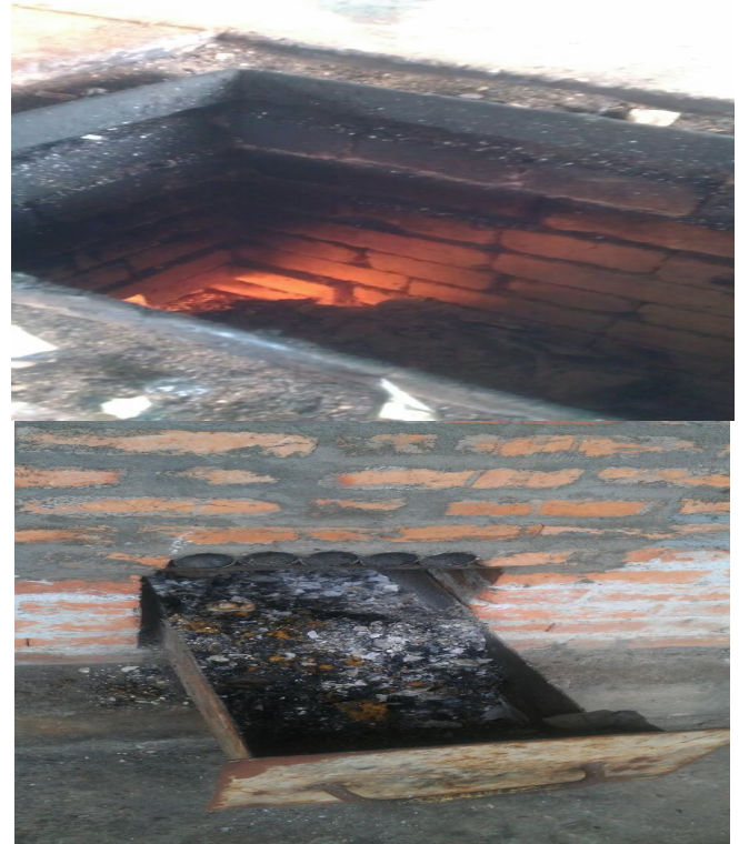
Fig. 4 Inside view of the Incinerator and ash produce after incineration

Incineration is one of the methods used to destroy pathogens from healthcare waste [14]. The three facilities surveyed had incinerators one of which was not functional. These incinerators were used for the combustion of waste generated from the facilities. Furthermore, they didn't adhere to the international standards. In the United States and some developing countries, autoclaving, Microwave disinfection, etc., are used as treatment method of wastes. However, with the lack of finances, most West African countries tend to practice incineration as the only cheaper treatment method. It was observed that the incineration facility was operated by unskilled personnel, and the incineration process was not subjected to internal and external monitoring as well as proper maintenance and inspection. Ash produced from the incineration process was improperly disposed of. It was also observed that operators of incinerators had no protective clothing. This however was due to the lack of equipment. At present there is no centralized treatment facility in Liberia.