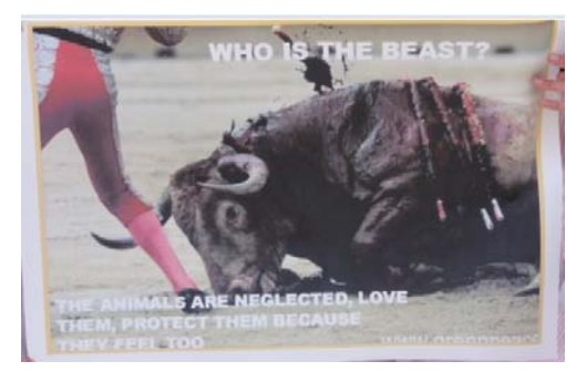
Fig. 6 Poster designed by a group of students-against bullfight

Everything was handmade, which is very important to highlight. It is demonstrated that students really put effort on doing this task, as a result of the motivation presented in the development of this workshop. This is a problem that is affecting most of the schools nowadays. They expressed that this is something that people should stop doing. They also invited people to change that before they experience the same from others.