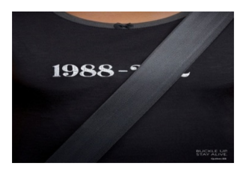
Fig. 3 Third image analyzed in class