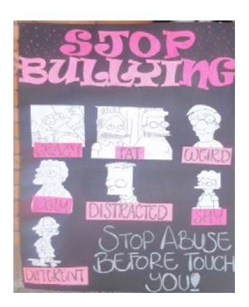
Fig. 5 Poster designed by a group of students -against bullying

The previous sample showed the expression that this group had against the use of animals for vanity and to be fashionable. They took this as a whole showing clearly a point of view. They also try to convince with the sentence, call to action, the images were well chosen and there poster is shown as a whole. Everything was clearly designed by them. They also took into account the first part of the workshop, which was about the parts of an ad.