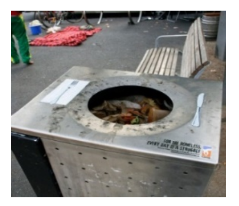
Fig. 2 Second image analyzed in class