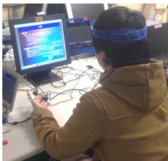
Fig. 1 Experimental environment

The encoder (ProComp Infiniti, Thought Technology Ltd.) can sample physiological data at 2048 s/s and 256 s/s via the sensors and electrodes, respectively. The sampled data were recorded on the PC.