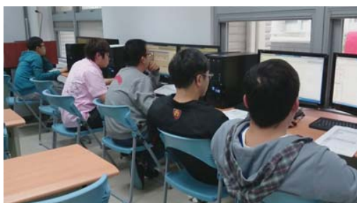
Fig. 2 The learning process