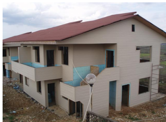
Fig. 8 Photo of the unit during the construction [33]

Beriköy is a project that which has been started by eleven architecture and engineering students in September, 1999 and, as Jan Wampler says, reflects a progressive approach. The group has worked for three months in order to determine the concept of the settlement and the first design ideas. In January, 2000 the projects have been brought to Turkey and opinions of some academicians from Istanbul Technical University and various professionals have been 50 dwellings were planned; each dwelling living 60-90 square meters in two stories. Dwellings were coming together as a group of two or four units. In dwellings, balcony, sun roof and other facade options have been left to the users' preferences [34].