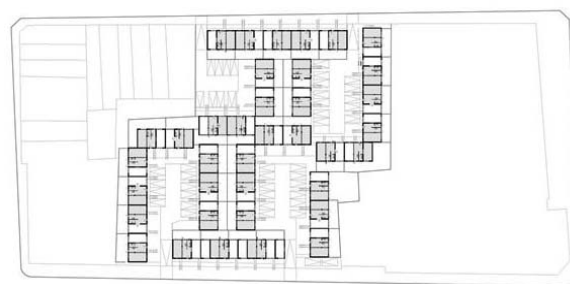
Fig. 4 Site plan of Quinta Monroy [31]

In this new solution, instead of a thirty square meter small house, a seventy two square meter big house whose half has been finished is built. The parts which are hard to construct such as kitchen, bathroom, and stairs are constructed by the government and the remaining parts of the house will be constructed by the users according to their needs and budget in progress of time. With this approach which increases the satisfaction ratio of users, the project has been finished in a short period time.