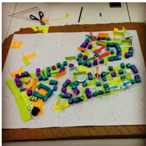
Fig. 11 Users are playing the game named "simulasyon" [36]

The design team said that taking the users' opinions into consideration made them happy and made the game very efficient. Moreover, 10 different site plans initiating from residents' ideas (Fig. 12) have been converted into three dimensional models and the resulting models have been analyzed. In the next phase, with the help of the analysis obtained from the game, real alternative designs have been prepared in the direction of users' desires [36].