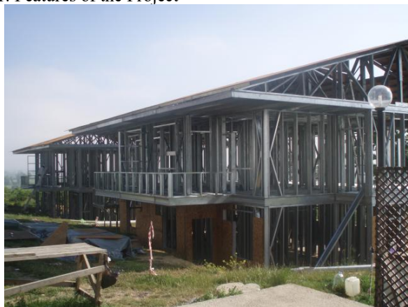
Fig. 7 Steel structure of Beriköy [33]