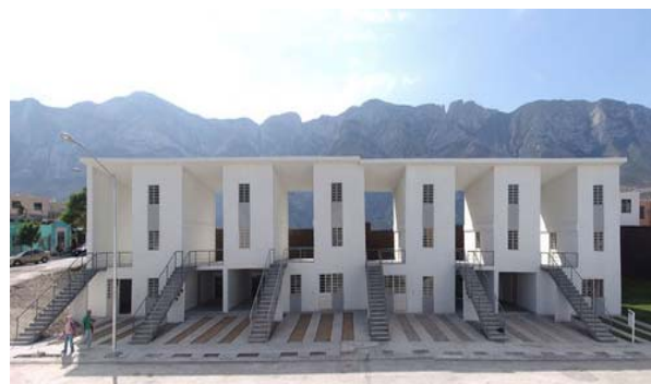
Fig. 5 Quinta Monroy before the users' intervention [31]

In this new solution, instead of a thirty square meter small house, a seventy two square meter big house whose half has been finished is built. The parts which are hard to construct such as kitchen, bathroom, and stairs are constructed by the government and the remaining parts of the house will be constructed by the users according to their needs and budget in progress of time. With this approach which increases the satisfaction ratio of users, the project has been finished in a short period time.