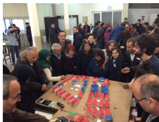
Fig. 10 Users are playing the game named "simulasyon"[36]

In order to achieve the user participation, a game called "Simülasyon" (Simulation) has been designed. The aim of the game is to take the users' opinion about the environment and their dwelling into consideration in order to create the site plan and built concept. (Figs. 10, 11)