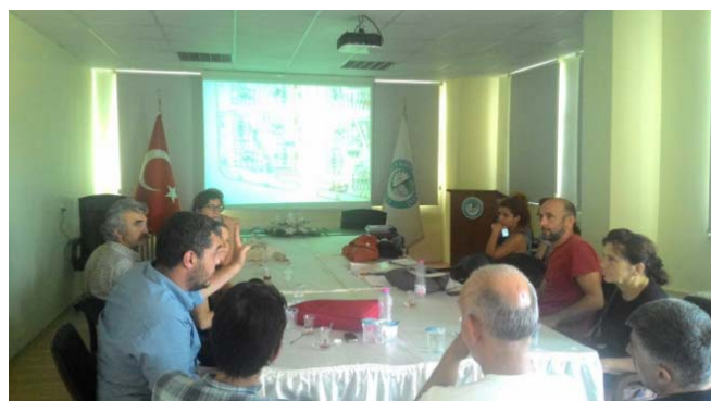
Fig. 13 Giving information about the project to local government [36]

The members of the cooperative and some volunteers have given information about the details of the project to the local government and they have had an exchange of ideas (Fig. 13). After the technical drawings have been completed, the license to start the building process has been acquired. It is aimed that user participation will be achieved also in the building process [36].