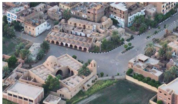
Fig. 1 Contemporary aerial photo of New Gournia [24]

that the name of the book has been changed to "Construction together with the public" in the French translations is a good indication that the mission of Hassan Fathy has been understood better through time [27].