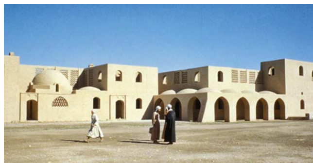
Fig. 2 Street in New Gournia in the 50 s [24]