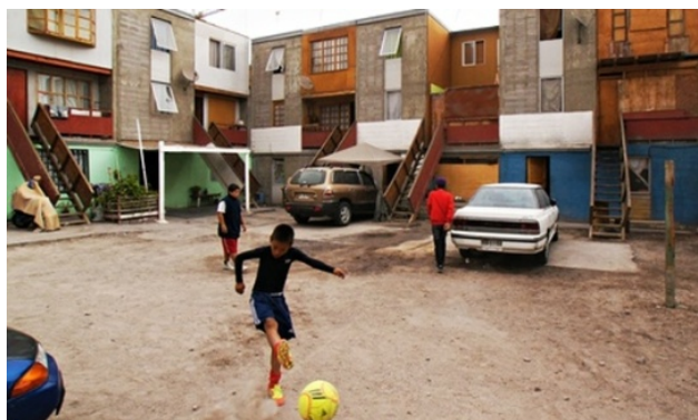
Fig. 6 Quinta Monroy after the users' intervention [31]

Elemental's approach allows the users to shape their home depending on their needs and budgets over time. By doing so, it has become one of the examples in which the architecture can be a solution to the problem of poverty and lack of dwelling. By creating these advantages, Quinta Monroy has become a role model to the upcoming projects [32].