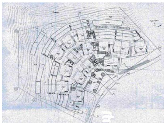
Fig. 9 Site Plan of Beriköy [34]