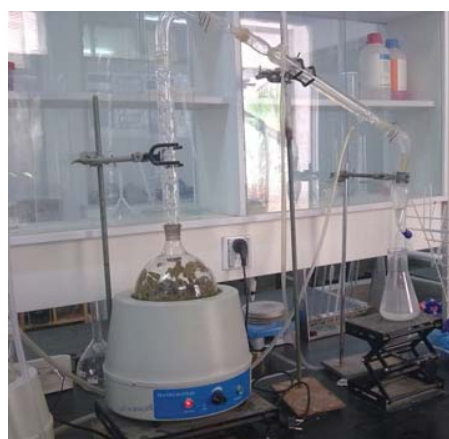
Fig. 1 Installation of hydrodistillation (Clevenger apparatus)

The hydrodistillation of Eucalyptus camendulensis (leaves dry) is performed using a Clevenger-type device (1928) Fig. 1.