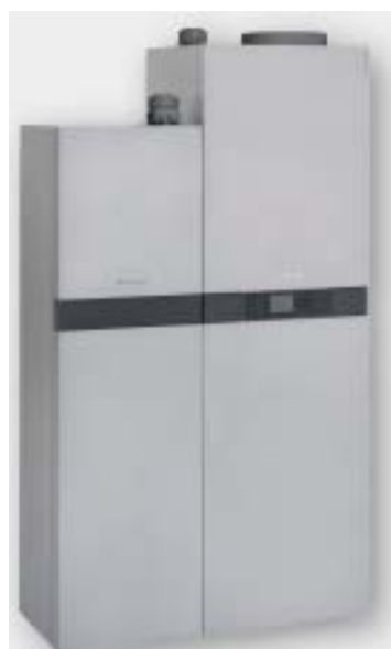
Fig. 3 Vitovalor 300-P is 0.75 kW CHP System

Vitovalor 300-P is 0.75 kW PEMFC based fuel cell CHP system which is integrated with integral gas condensing boiler for peak load as shown in Fig. 3. Cost of installation of this system is reported as £22000. Average expected return on this investment is £1000/annum [8]. Electrical efficiency of the fuel cell module is reported as 37% and overall efficiency is 90%. It delivers a maximum of 19 kW of heat output and produces 15 kWh of daily electricity. Internal boiler will start automatically when the heat demand goes above the heat produced by the fuel cell i.e. in the peak time. Vitovalor 300-P also comes with an App (mobile application) to remotely control the CHP operations including to change room temperature, control program timers, start and stop, etc. [8]