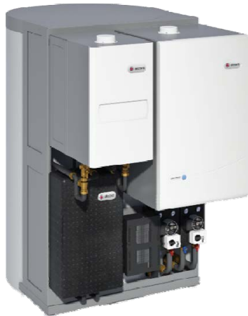
Fig. 4 Elcore 2400 0.3 kW CHP System