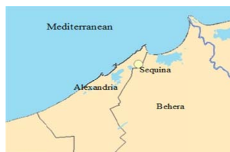
Fig. 1 Location of 'Sequina' slum area

of space converts the building rooms into topological graph representation, which interprets spatial measurements with graph algorithms [9]. Meanwhile, the spatial visibility enriches the space syntax of housing decodes [7]. This specific study focuses on the integral measure of rooms according to the analytical criteria of: 1) real relative asymmetry (RRA) of collective layouts, 2) relative asymmetry (RA) of individual layouts, and 3) spatial visibility in layouts. The correlation of these issues clarifies the social logic of spatial structure at different levels of integral resolutions. The prospected social overview adjusts the long-term comprehensive plan strategy of redeveloping slum areas for a better future of Alexandria [1].