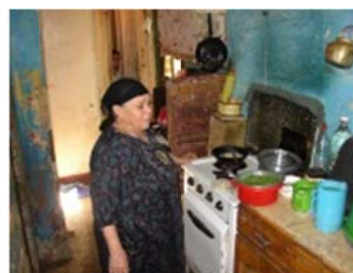
Fig. 6 Interiors