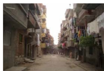
Fig. 3 Passages

Nevertheless, the layout of multifunctional vertices at the various graph levels is more integrated than the other of functional merge only at the deep 'inhabitant' domain. The isomorphic graphs of layouts '4 & 1' enforce the same observation with the less layout integrity of single function per room. However, the graphs of layouts '3 & 20' have a fewer number of deep vertices with a higher spatial integrity. Thus, the deepest graph level of more vertices with single functions causes the less integration of layout. Another phenomenon observes the more layout integration of direct access between the 'visitor' and 'inhabitant' domains, while the insertion of access corridor between them causes the decrease of spatial integrity. Meanwhile, the first two layouts of integral range split their utility rooms apart from each other, while the further three layouts set the 'toilet' inside the 'kitchen' depth.