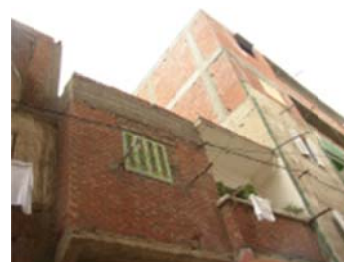
Fig. 4 Heights