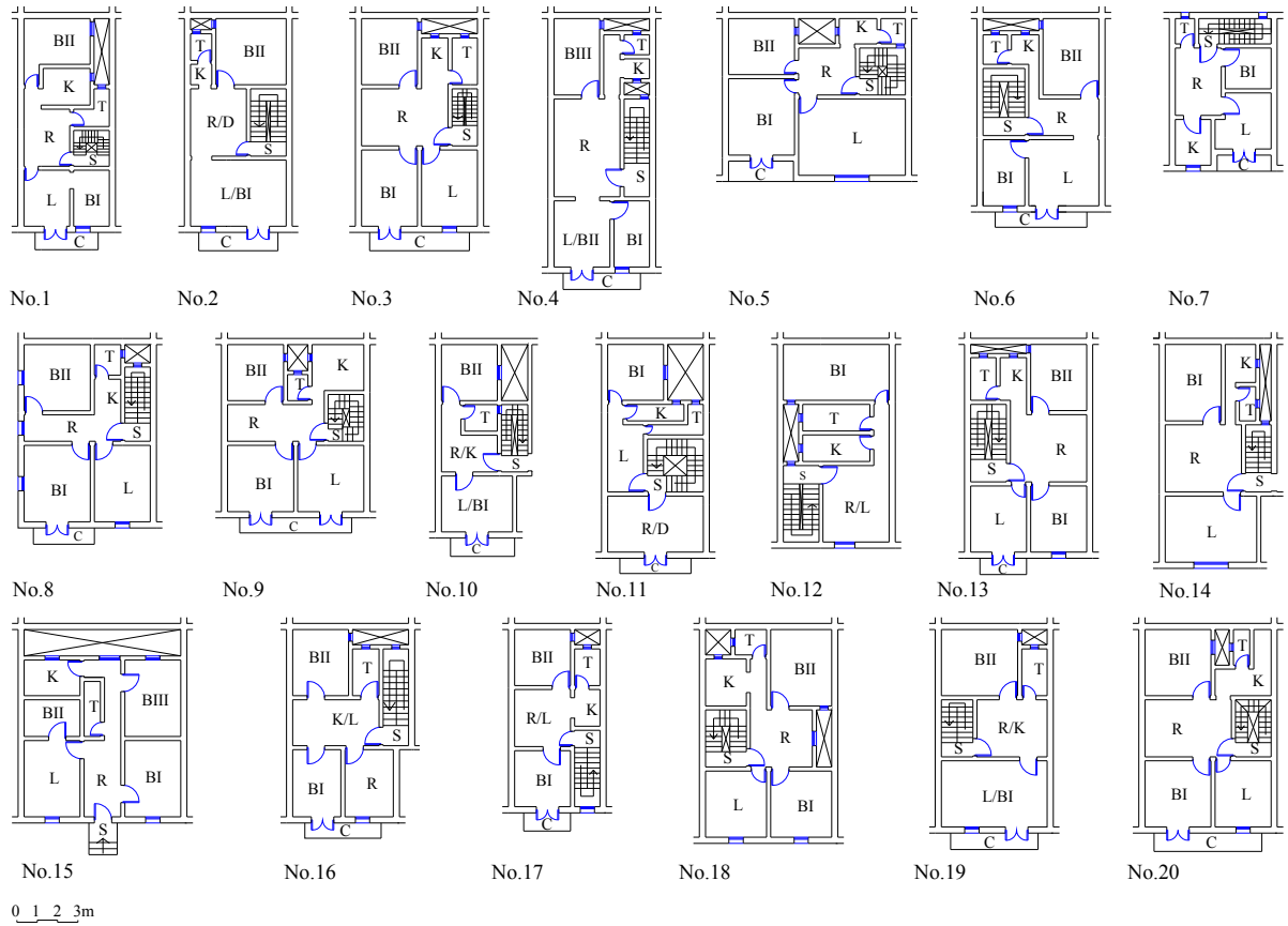
Fig. 7 Typical floor plans of survey buildings in 2015