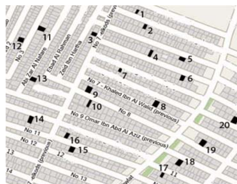
Fig. 2 Location of sample buildings