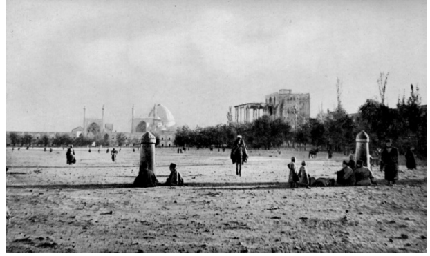
Fig. 2 Naghshe Jahan Square in Safavi era as city center, [8]