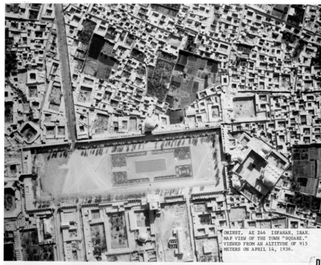
Fig. 5 Naghshe Jahan Square Bird view in 1937, [24]

situation which had not any vitality in urban life. Likewise changed the area as the most powerful public space to attract citizens and visitors. Also there was more attention to the restoration of historical buildings and facade of the square as well as revitalization of the urban space. Architectural revitalization had much effect on the public and commercial activity of the city center which missed in Qajar era as a strong city center.