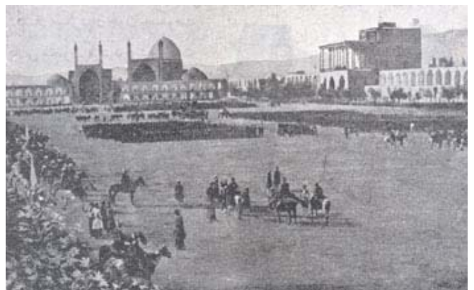
Fig. 4 Naghshe Jahan Square as military camp in Qajar era, [22]

Some of the shops rented by foreign traders but generally