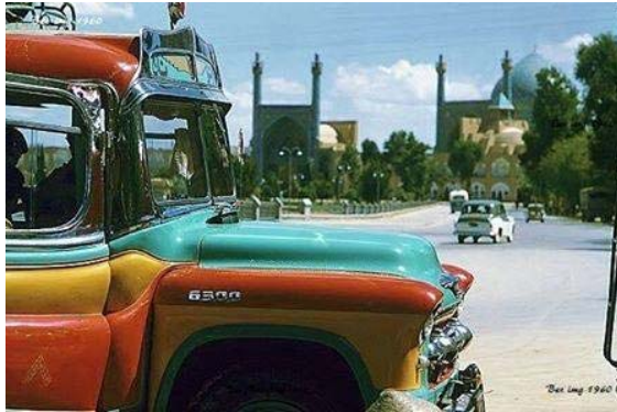
Fig. 6 Increase of vehicle accessibility in Naghshe Jahan square in Pahlavi era, [26]

according to decisions of supreme traffic council of Isfahan in April of 2014, entry of any motor vehicle such as car, bus and motor cycle to the square was forbidden. (Fig. 8) So after passing around 80 years, Naghshe jahan square returned back to the origin condition from accessibility perspective and use as powerful historical city center in Isfahan. Also by this action most of the unworthy urban elements from visual view will remove.