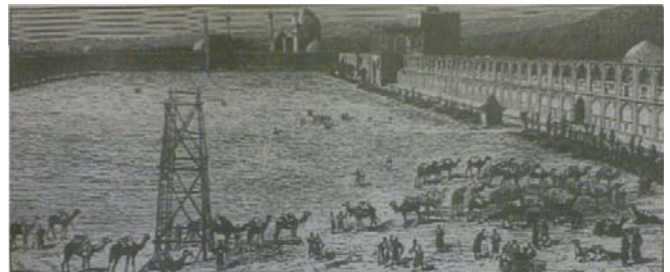
Fig. 3 Quality of Naghshe Jahan Square in Qajar era, [8]

Naghsh-e Jahan square after Safavi period In the Qajar era, in the overall structure of the city center (Naghsh-e Jahan Sq.) had not much changed, but in all aspects which included the construction of buildings, urban activities and the economics of the place loss dramatic prosperity. The most important document in this field was in the late Qajar period which had been shown in a map of the Sultan Syed Reza khan in 1302 AD (1923). According to Ojhen Finlanden and Rene Dalman, French and Germany explorer in Qajar era, most of the shops around the which worked in Safavi period was demolished and some of them used as Storage, stable and coffee house. (Fig. 3)