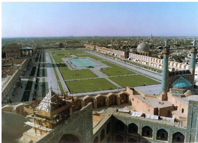
Fig. 7 Naghshe Jahan square in 2014, [26]