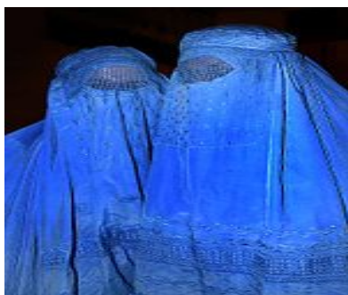
Fig. 4 Burqa Cultural Joke [10]

cloth whose top side is sewn to corresponding portion of the head-scarf, so that the veil hangs down loose from the scarf, and it can be turned up if a woman wishes to reveal her face (otherwise the whole face would be covered). In other case, the niqab part can be a side-attached cloth that covers the face below the eyes' region. It is all illustrated by the car in the picture which turns out to be the main topic to burst laughter. Let us compare and find the similarities between the picture of the car and the real Burkha shown by Figs. 3 and 4. Thus, Fig. 3 is such kind of satire which implies the message that it is impossible for Afghani women to drive a car by themselves. Somehow, the design of the car produce a humorous effect upon the readers. Apparently, it is such kind of an interesting way to express a satire or even a protest.