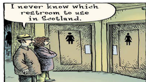
Fig. 2 Scottish Cultural Joke [8]

Joke which is created based on cultural aspects may contain conventional implicature which is generally known by people worldwide. The example is provided in the following illustration: