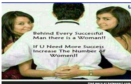
Fig. 1 Gender Joke [7]

The joke implies a message that a wife is often a trouble to a husband. It also describes that in Western culture a wife plays a greater role in the family. Next, the following joke is taken from Facebook. It is the example of a joke which contains implicature related to gender which focuses on a man: