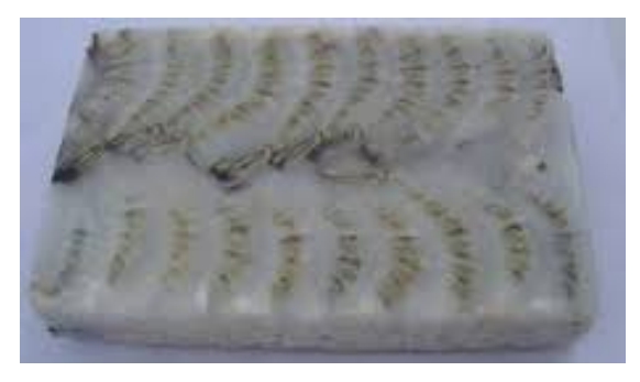
Fig. 4 Frozen shrimp and exports [12]