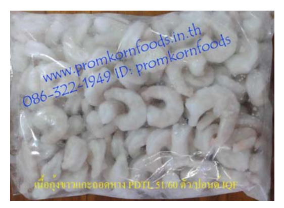
Fig. 6 Meat products and take off our tail [12]