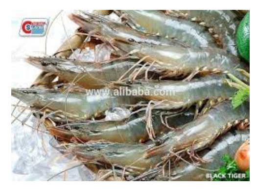
Fig. 7 The shrimp through the criteria [12]

It can be seen from Table I that in general, the operation problems are at high level. When considering in details, it was found that 4 aspects, i.e. labors, production, marketing, and the