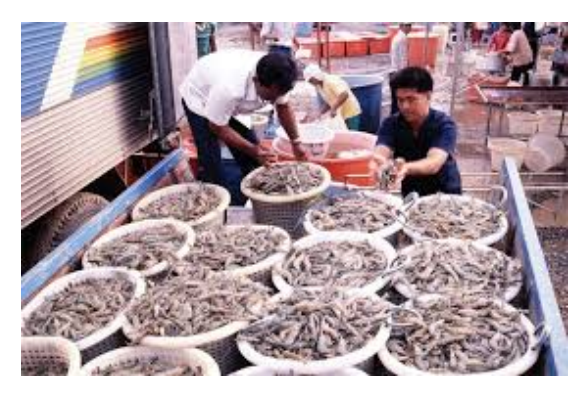
Fig. 1 The process of selecting shrimp [12]