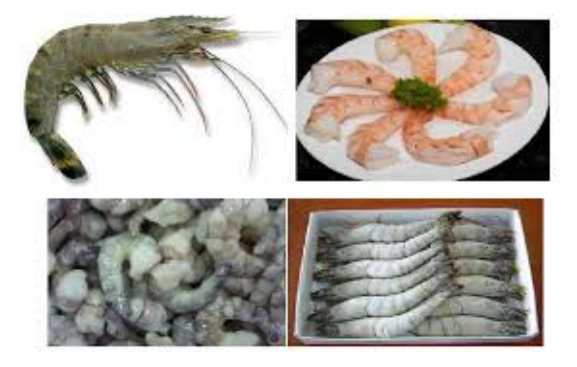
Fig. 3 Size, after the trimmed shrimp and prawns [12]