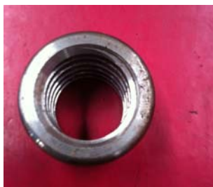
Fig. 2 The skin [14]