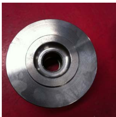
Fig. 4 Prepared casting with the skin [14]