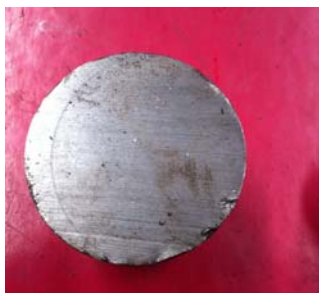
Fig. 1 The casting [14]