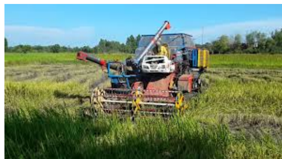
Fig. 6 Rice paddies [14]