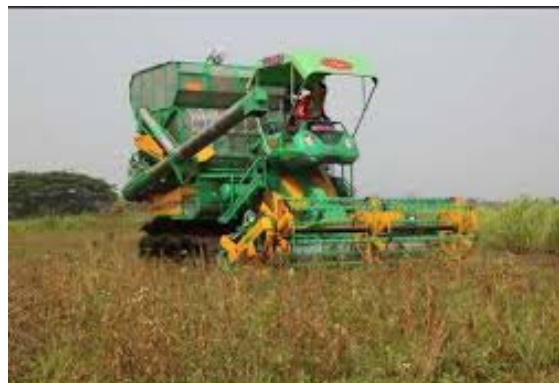
Fig. 5 Versatile tool of peasant harvesters [14]