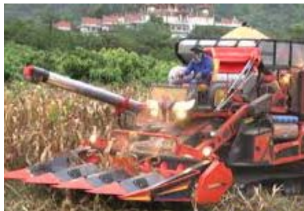
Fig. 7 Hook served with rice padding seeds from the crops [14]

When compared, the problems on basic factors in running the business in Table II, it was found that there was no statistically difference at .05 in managing of the small and medium size agricultural machinery manufacturers. However, there was a statistically significant difference between the small and medium size agricultural machinery manufacturers on the aspect of policy and services of the government. The problems reported by the small and medium size agricultural machinery manufacturers were the services on public tap water and the problem on politic and stability of the country [5], [15]-[32].