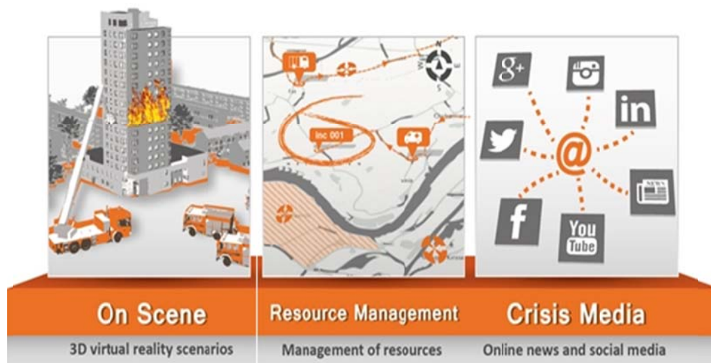
Fig. 2 XVR Platform

The application Virtual Reality training software for safety and security (XVR) consists of several programs. They are: XVR Crisis Media, XVR Resource Management, XVR On Scene and XVR Toolkit (Fig. 1). These programs serve to the resolvers of emergency or crisis situations in preparation and practicing practical abilities [16].