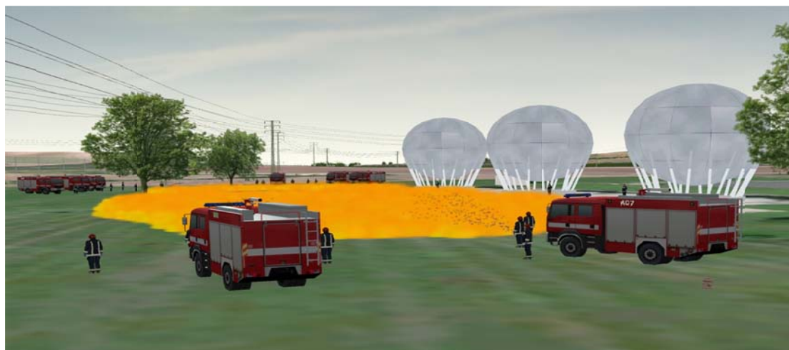
Fig. 4 Overview the Interface of Simulator WASP

Environment in the simulator is ensured by the combination of terrain database created from the detailed geographical data, model of weather and other dynamic environmental models. Terrain database contains all common objects in the countryside (bodies of water, roads, built-up areas, vegetation, relief, type of soil and other objects). Individual objects have predefined features influencing simulation of their own entities in relation to their purpose. Weather editor enables to set basic parameters (date and time, air temperature, velocity and direction of the wind, type and intensity of precipitations, humidity and pressure of air, type of cloud cover, light intensity etc.) [18]. Some of the parameters are mutually interlinked based on the actions happening in the atmosphere known from meteorology. Dynamic models of environment enable to modification the countryside with objects and phenomena which can change their form in the course of time. There are accidents simulated in great detail as well as a vast