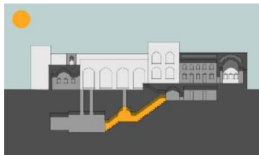
Fig. 2 Stairs to Shovadan and Shabestan (an underground space)

that are connected to Shovadan on the left and to Shabestan on the right of the picture.