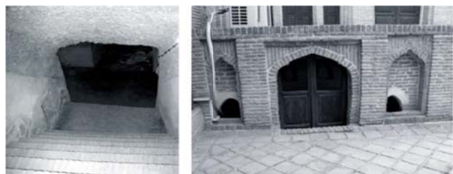
Fig. 1 Entrance of Shovadan