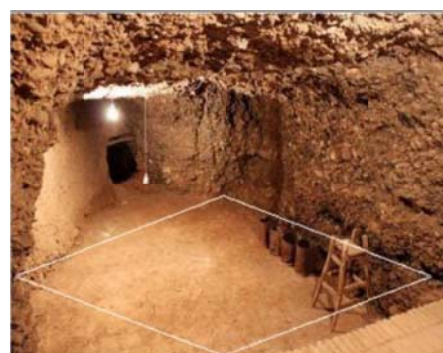
Fig. 3 Shovadan Hall

Sometimes in large Shovadans there is a difference in the depth of Sahn with other spaces and caused Sahn to be recognized easily from other spaces [1], [2], [4]. Fig. 3 shows a Sahn in a Shovadan. White line shows the districts of Sahn.