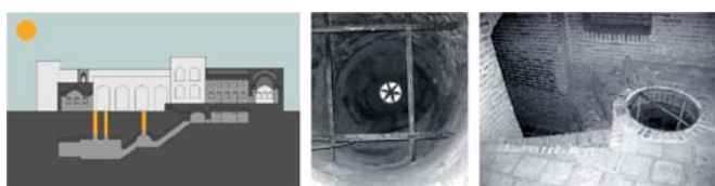
Fig. 6 Darize (a cylindrical vertical duct)

In Shovadan, the temperature of Kats and wide stairs, that have less depth than Sahn, is more than the temperature of Sahn [2]. The underground connection between neighboring Shovadans and having access to the riverside through the underground way for avoiding the intense solar radiation during summer days and for defense against enemies caused the formation of an underground life in Dezfool city. During the hot days of summer social connections were made in Shovadans.