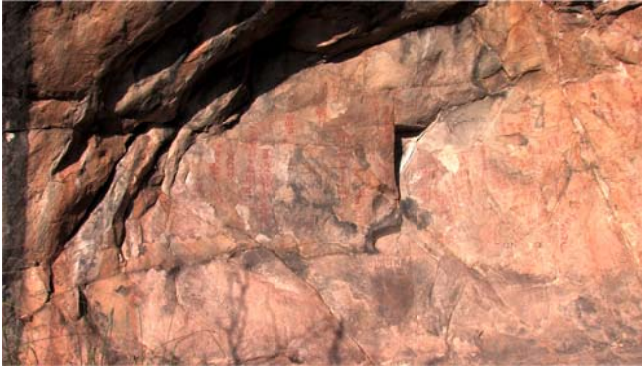
(a) Ifigha site

These sites' attendance is very low in Kabylia and concerns only some researchers and students and some tourists, it is mainly due to the eccentric location and difficult access of these sites. On the other side, the integration of this heritage in the daily life of the local population is very poor or inexistent.