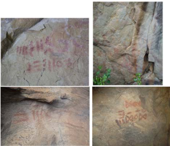
(b) Tifra site (Tigzirt sur mer)