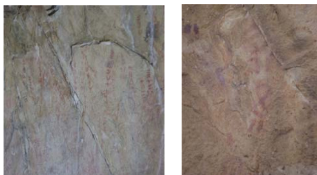
(a) Ifigha site (b) Ahmil site (Yakouren)