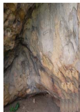
Fig. 5 Use of cave as shelter, Tifra site (Tigzirt sur mer)

The caves misused by shepherds as shelter which may cause their deteriorations. (Fig. 5)