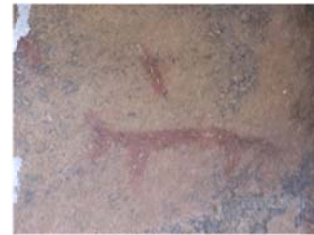
(e) Tarihant site (Azrou Imayazen)