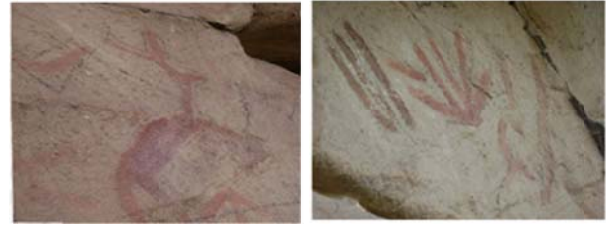
(d) Ait Ighil site (Yakouren)