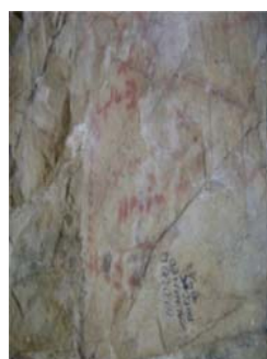
(a) Ifigha site

The nonexistence of keepers, facilitates the degradation and destruction of these sites. Thus, sites that have stood for thousands of years to the vagaries of nature can disappear in less than a decade.