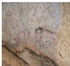
(b) Tifra site (Tigzirt sur mer)