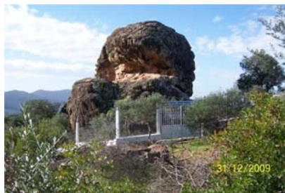
Fig. 6 Safeguarding of rock art site