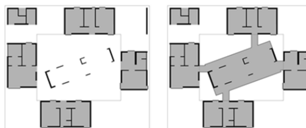
Fig. 3 Multi-shaped courtyard system

Two houses on the outskirts of the small rural town of Dali were the starting point for an investigation into how the surrounding landscape redefines the main architectural element of the courtyard: A courtyard, flanked by the two elongated parts of the house and studio (Fig. 3), or surrounded by the private spaces is organized as clusters of independent volumes. In these examples the aim at arriving to a fusion of built and unbuilt environment, of immaterial and material worlds is the driving force of the architectural approach.