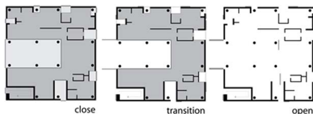
Fig. 2 Network of central and peripheral courtyards

The ultimate malleability and flexibility of the house allows the user to constantly alter the spatial conditions, merging himself into unison not only with the built part of the dwelling, but with the equally constituent element of nature and weather.