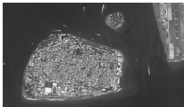
Fig. 1 Malé in relation to the international airport [29]

The local population of 341,000 resides on 188 islands, administered as seven provinces [28]. To minimize developmental challenges and economic cost associated with dispersed population, the government at times has carried relocation programs, which is highly unpopular among locals. For easy access to higher education, improved health and other welfare, over 39% of local population reside in the capital island Malé. Further, a large number of expatriates and a transient local population from outer atolls reside in Malé, an island approximately 2 km 2 (Fig. 1), making it one of the densely populated capitals.