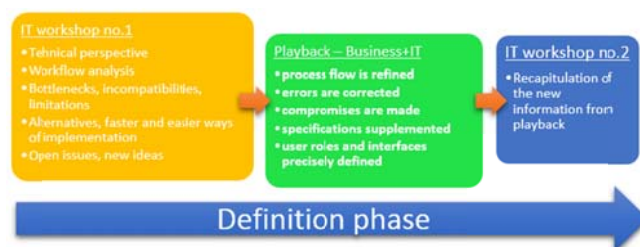
Fig. 1 Steps in the BPM definition phase

Beside the one playback, two workshops were held internally in the IT department (Fig. 1). This prevented larger misconceptions, misdirection's and failures in the beginning of the project. First workshop was after the initial overview of the user specifications and before the first playback, and the second one after the playback. The purpose of that workshop was to carefully analyze potential flaws in the overall process workflow, defined by the business sector, from a technical perspective. Possible bottlenecks and incompatibilities with existing applications are identified, some alternatives to ease and speed up the implementation are suggested, and possible technical limitations noted. Undefined cases, and any open questions are listed, and new ideas considered. Based on the conclusions and initial business specification a basic data model was developed, specific authorization and user roles sketched to demonstrate control, basic forms constructed to show the visual imprint. With the described preparations in place, the first playback was held. Together with the business users the process flow is refined, errors corrected, compromises made, specifications supplemented, user roles and interfaces precisely defined.