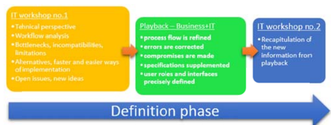
Fig. 1 Steps in the BPM definition phase

Beside the one playback, two workshops were held internally in the IT department (Fig. 1). This prevented larger misconceptions, misdirection's and failures in the beginning of the project. First workshop was after the initial overview of the user specifications and before the first playback, and the second one after the playback. The purpose of that workshop was to carefully analyze potential flaws in the overall process workflow, defined by the business sector, from a technical perspective. Possible bottlenecks and incompatibilities with existing applications are identified, some alternatives to ease and speed up the implementation are suggested, and possible technical limitations noted. Undefined cases, and any open questions are listed, and new ideas considered. Based on the conclusions and initial business specification a basic data model was developed, specific authorization and user roles sketched to demonstrate control, basic forms constructed to show the visual imprint. With the described preparations in place, the first playback was held. Together with the business users the process flow is refined, errors corrected, compromises made, specifications supplemented, user roles and interfaces precisely defined.