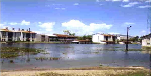
Fig. 1 Houses lying in the water as a result of overflow on the Iskele district of Lake Van

In our study, we learned association rules among past meteorological data and used these rules in combination with varying geographical coordinates of Lake Van itself and some specified regions around it both to forecast and validate possible overflows and underflows. The meteorological data parameters are as follows: lake altitude, amount of rainfall, evaporation on the surface of the lake, humidity and temperature. We collected data about these parameters from 22 meteorological stations recorded during 1990-2011 period. Some of these stations are: Adilcevaz, Ahlat, Çaldıran, Erçek, Erciş, Gevaş, Göldüzü, Güzelsu, Muradiye, Ovakışla, Özalp, Bitlis Reşadiye, Tatvan and Van stations. The relationships between these parameters were presented in the form of association rules. Finally, we analysed these rules to find possible causes of over and underflows.