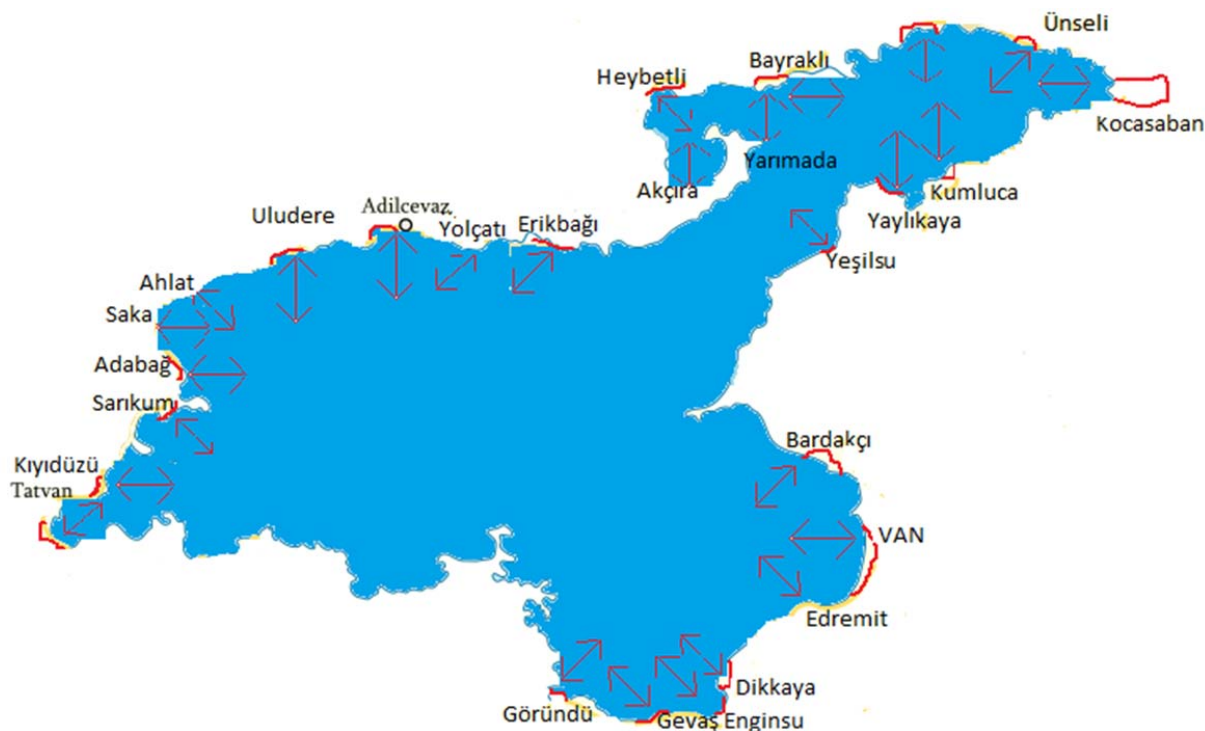
Fig. 3 Overflow areas and direction of overflows

Open Science Index, Computer and Information Engineering Vol:9, No:6, 2015 publications.waset.org/10002769.pdf