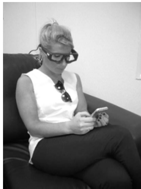
Fig. 1 The participant wearing eye tracking glasses while using iPhone 5S

The demo session was conducted two weeks prior to the research project in the lab. The demo session helped to identify the best possible settings arrangements needed during experiments. This was useful to test the experiment in terms of duration, settings of the software for eye tracking experiments, and post experiment interviews.