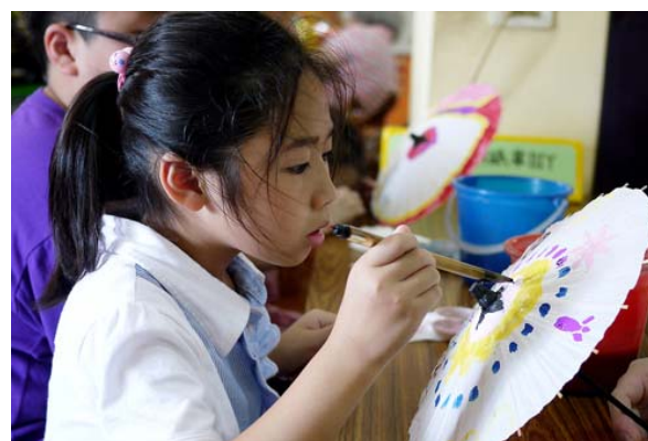
Fig. 2 DIY creative activities of handmade oriental parasol umbrella [22]