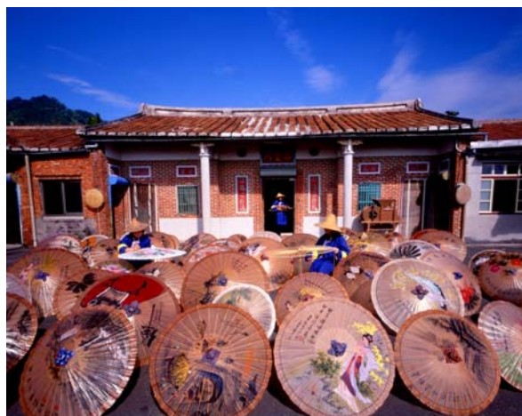
Fig. 1 Handmade oriental parasol umbrella in Kaoshiung [21]

to get a comprehensive sample of visitors.