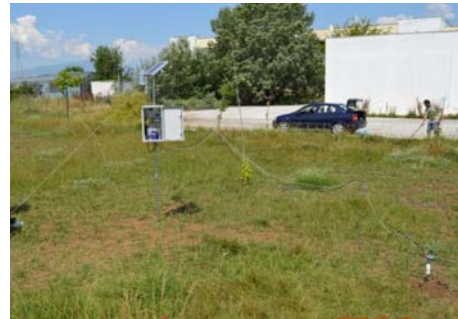
Fig. 4 The field setup of the Automated Soil Erosion Monitoring System (ASEMS)

Erosion Monitoring System (ASEMS); a common surface erosion technique [6]. During the study period the system measurements will be compared with the measurements provided by the erosion pins.