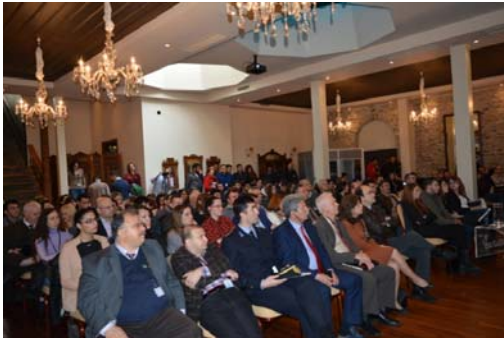
Fig. 5 Participants of the International Conference "Frontiers in Environmental and Water Management" that took place on 19-21 March 2015, in Kavala, Greece