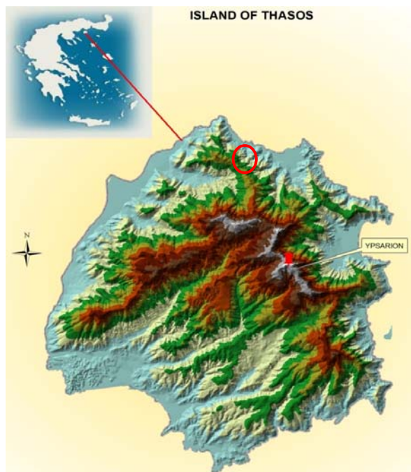
Fig. 1 A close up of Thasos Island and its location in Greece

the highest peak being Ypsarion with an elevation of 1203 m. The climate is characterized as Mediterranean. The average annual temperature is approximately 15.8 °C and the average annual precipitation is approximately 770 mm [4]. Because Thasos Island has a wide range of precipitation, slopes, vegetation types and land-uses, despite occupying a small area, it is an idea natural laboratory to study surface soil erosion.