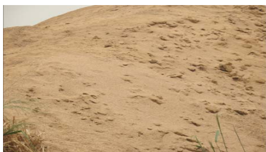
Fig. 1 Unburnt rice husk deposit in Gboko, Nigeria

The use and disposal of rice husks has frequently proved difficult because of the tough, woody, abrasive nature of the husk, their low nutritive properties, and resistance to weather, great bulk and ash content. In fact in South East Asia, the accumulating heaps of rice husk have become significant problems [8]. Figs. 1 and 2 showed unburnt and burnt rice husk dump in Gboko, which is a major rice producing towns in Nigeria. The aim of this study is to examine the possibility of introducing rice husk ash as a stabilizing agent in lateritic clay that is commonly used for civil engineering construction.