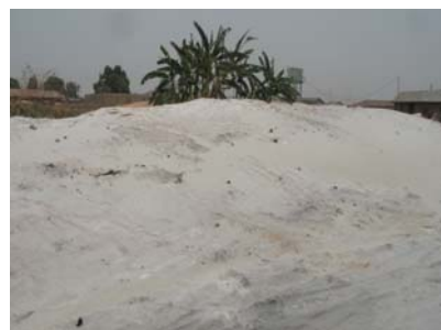
Fig. 2 Burnt rice husk deposit in Gboko, Nigeria