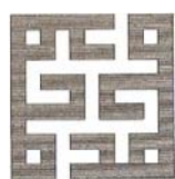
Fig. 6 Square and rectangular kufic script [1]

Calligraphy inscriptions are usually combined and set against a background of geometric and floral patterns which surround the letters. Also, they provide additional symbolic meaning.