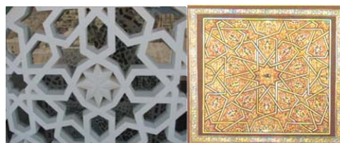
Fig. 4 The star shapes decorate most of the Islamic building 'the Dom of the Rock' [11]