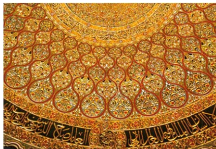
Fig. 5 Ornamenting the dome with calligraphic designs in the Dome of the Rock [11]

and objects. It has been used by non-Arabic speaking people such as Persians, Turks and Indians.