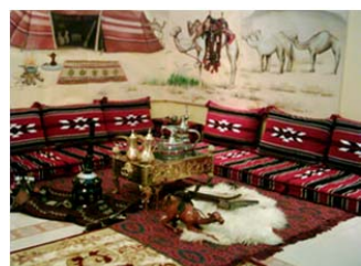
Fig. 9 Using the imported cushion covers and rug that imitate Bedouin products because of the absence of the traditional in the local marketplace; Photographed in 2007