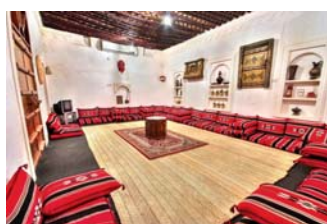
Fig. 8 The nature of the Arab people homes decorated with Turkish rug and imported cushion covers

Bedouin products were appreciated by local people who used them in decorating their houses and they are purchased by the tourists and countries around as a remembrance of their visit and decorative objects as well. However, with the evolution of home furnishing, local people became uninterested in and un-attracted to the Bedouin products as a result of the availability of imported soft fabrics in contemporary colours in the market at the time that Bedouin products remained stable on those respects.