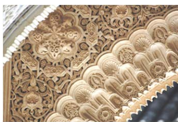
Fig. 7 The use of arabesque patterns in Alhambra Palaces [4]

Floral patterns can be seen in arabesque designs which are formed by an abstraction of the earlier leaf-scroll motifs [1]. This vegetal ornament is characterized by a continuous abstractive stem which splits repeatedly to produce a series of curving counterpoised vegetal patterns flowing in all directions. The sense of periodicity and the rhythm is very noticeable in these patterns (Fig. 7).