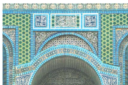
Fig. 2 The use of continuous geometric designs interlaced with overlapped floral and calligraphic designs in the Dome of the Rock [11]

Geometric motifs were used extensively in the Islamic world to decorate religious buildings as well as for designing decorative surfaces such as tiles, wood, book covers, papers, glasses, carpets, textiles, plasters, walls, ceilings, floors, doors, windows, pots and lamps. As Islam spread to new areas, artists combined their penchant for geometry with the existing traditional designs in these new areas which helped to create distinctive Islamic motifs [14]. This art symbolizes the natural Islamic vision of the universe and some of the greatest examples of these geometric patterns can be seen in examples of Islamic architecture such as the Dome of the Rock and Alhambra Palaces. A wide range of basic Islamic motifs, drawn from geometry, calligraphy and floral influences make up an endless variety of forms (Figs. 2 and 3). Artists used different bright colours with these geometric patterns such as deep blue or turquoise, red, black, and white with gleaming gold and glitter effect. Though beautiful and harmonious, these include hues not found in nature [5], [14].