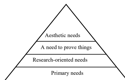
Fig. 1 Motivation hierarchy while studying mathematics

Developing mathematical understanding is determined by a set of relevant needs and motivational factors. This can be envisaged as a triangle of needs which demonstrate linked hierarchic requirements (Fig. 1).