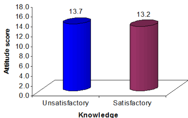
Fig. 3 Association between knowledge and attitude of the study sample