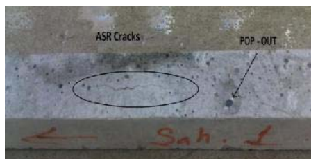
Fig. 5 Expansion cracking due to ASR and Pop-out of aggregate