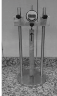
Fig. 1 Comparator

cementations materials (w/c) was kept at 0.47. Two mortar bars (25 × 25 × 225 mm) were cast for each mortar mixture. After 24 hours, mortar bars were removed from the molds and stored in a water bath with tap water at 80°C for a period of 24 hours. After this preconditioning, the length of mortar bars were measured (initial reading). Then they are placed into storage containers filled with 1 normality (1N) of NaOH solution at 80°C for the duration of the test. Subsequent length readings were made using comparator seen in Fig. 1 on 1 st , 3 rd , 7 th , 14 th days. Expansions were measured as changes in mortar bar length. The same procedure was followed for the entire test.