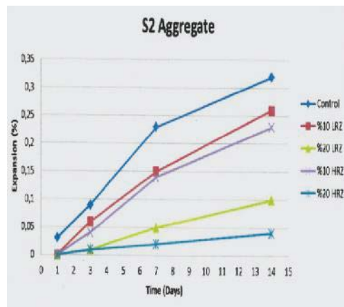
Fig. 3 Expansions of mortar bars cast with S2 aggregate