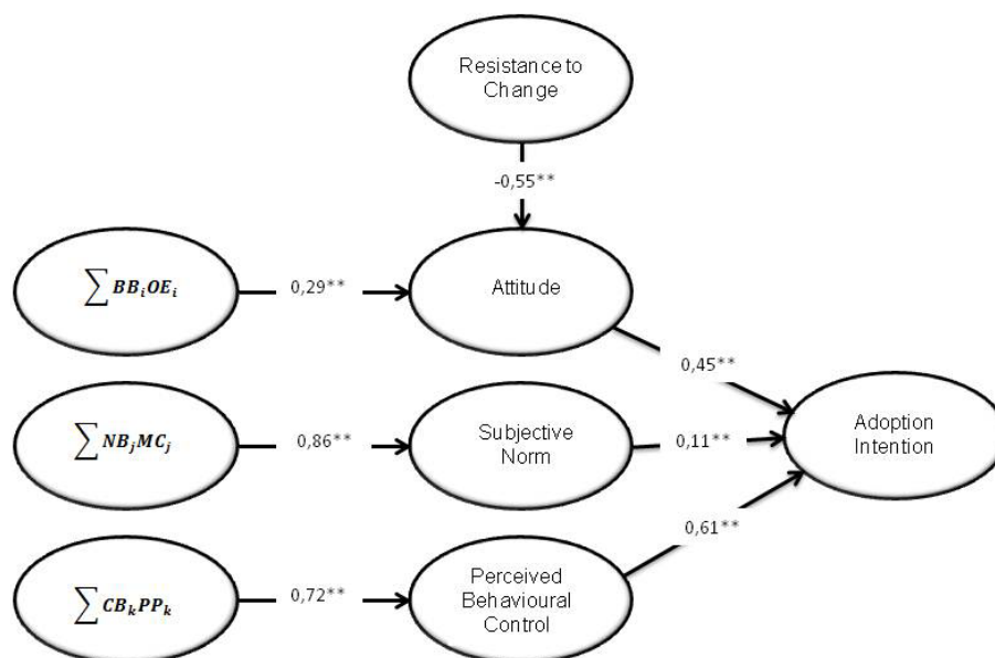
Fig. 2 Final model. ** P < 0,01 . Note. BB = Behavioural Beliefs; OE = Outcome Evaluation; NB = Normative Beliefs; MC = Motivation to Comply; CB = Control Beliefs; PP = Perceived Power