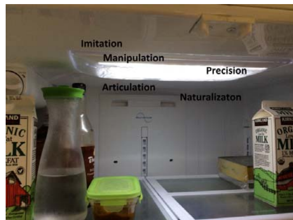
Fig. 3 Schematic view of psychomotor domain

Consider the possibility of a broken filament. Otherwise the socket needs to be checked.