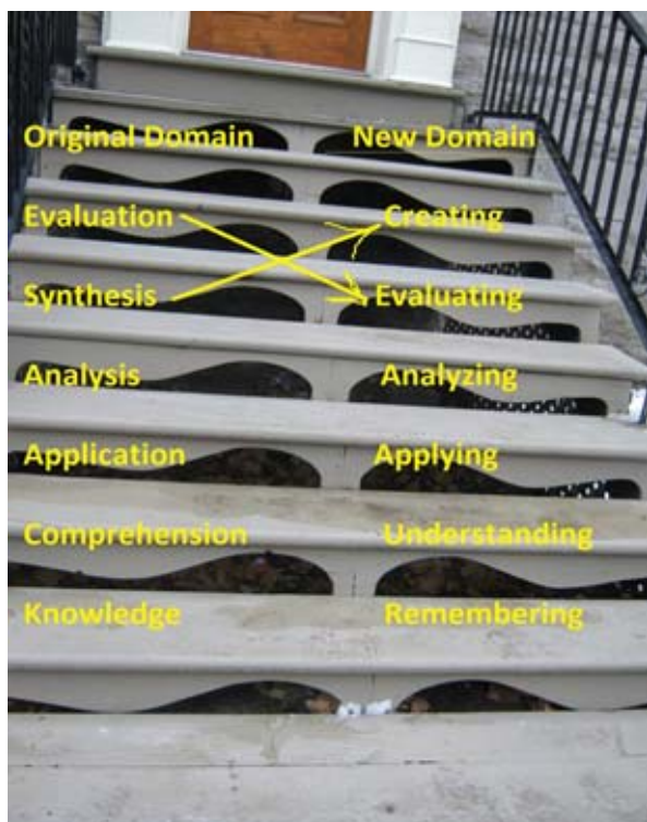
Fig. 1. Schematic view of original and revised version of cognitive domain