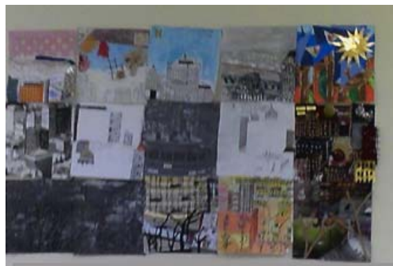
Fig. 4 An illustration of the map of Montreal by participants of a creative workshop at YWCA Montreal, Canada - November 2013

Although there were critical points when Bloom developed the taxonomy, five decades later it continues to guide educational practices. However it is believed that considering the classification of educational objectives in adult education is crucial. Adults, who do not suspend learning, keep their memories fresh for a long time. In the other words the more they keep their learning level higher according to the taxonomy the later experience memory loss.