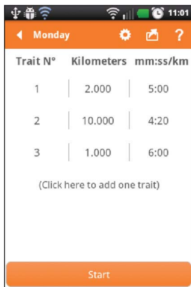
Fig. 1: Workout creation menu.