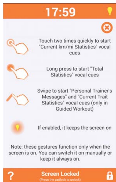
Fig. 3: On demand vocal cues guide.