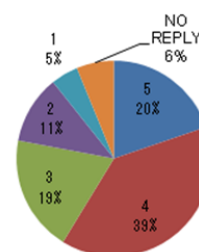
Fig. 1 Distribution of Students' Response 1

1. Do you think that self-assessment of organization and topic development of English composition is effective to improve English proficiency?