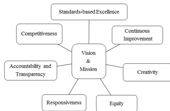
Fig. 2 Values of SVU, Adopted from [31]

Vision, Mission and Values: The vision of SVU is "scientific leadership to build a knowledge society and sustainable development" [31]. We can infer that integrating the role of university on building a knowledge society and sustainable development represents a legitimate and moral foundation.