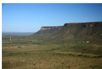
Fig. 4 Serra Espirito Santo

Severe environmental impacts are taking place in the Park due lack of local monitoring of tourism, and the need for more studies on tourism indicators that may be used as a tool for monitoring and managing Conservation Units [6].