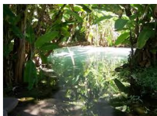
Fig. 2 Fervedouro