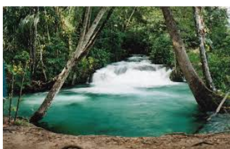
Fig. 3 Cachoeira do Formiga