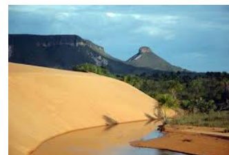
Fig. 1 Dunas

The place offers attractions such as dunes, springs called “ferveidouro”, waterfalls and rivers, which provide ecotourism, and has been explored in a disorderly way (see Figs. 1-4).