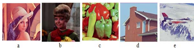
Fig. 2 Original test images: (a) Lena, (b) Zelda, (c) Fruit, (d) House and (e) Airplane

From the results listed in Table I, the proposed codec achieves a high performance, and we can conclude that about 0.1299-0.3404-bit rate reduction on average is achievable by using the proposed method (A-3). The subjective visual quality is compared using a different color image, as shown in Figs. 3, 4, 5, respectively. Figs. 3 (c), 4 (c), and 5 (c) show less block artifact than resulted image by A-3 with block size 8x8 in Figs. 3 (a), 4 (a), and 5 (a).