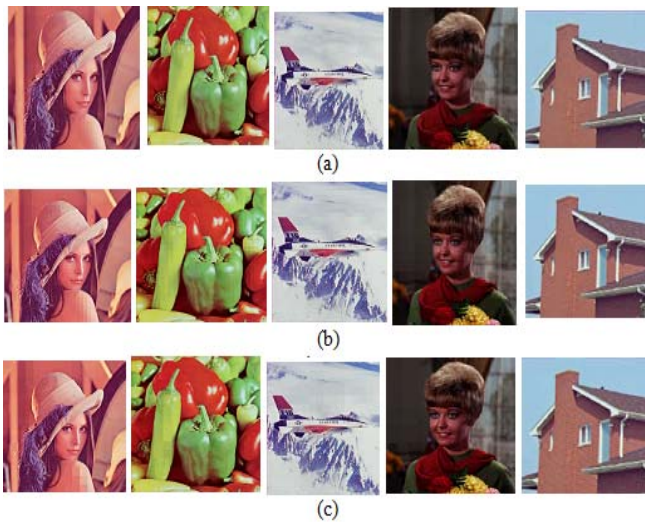
Fig. 4 Compressed images visual performance of the proposed method (A-2): a) DCT block size is 8 \times 8 , b) DCT block size is 16 \times 16 and c) DCT block size is 32 \times 32

The CR results of the proposed method (A-3) and the other compared methods MHC scheme [17] are presented in Fig. 6. The A-3 obtains 35.33 on average and the best performance (41.0029) in House. Compared with CBDCT-CABS [18], the A-3 achieves 2.8334 dB higher average performances in PSNR, especially in Airplane the improvement is up to 4.15 dB. The A-3 also performs high better by 2.27 dB on average than the most competitive method of JPEG (as shown in Fig. 7).