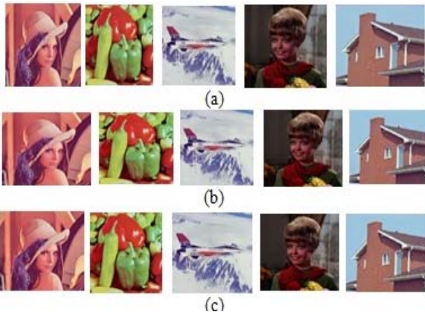
Fig. 3 Compressed images visual performance of the proposed method (A-1): a) DCT block size is 8 \times 8 , b) DCT block size is 16 \times 16 and c) DCT block size is 32 \times 32