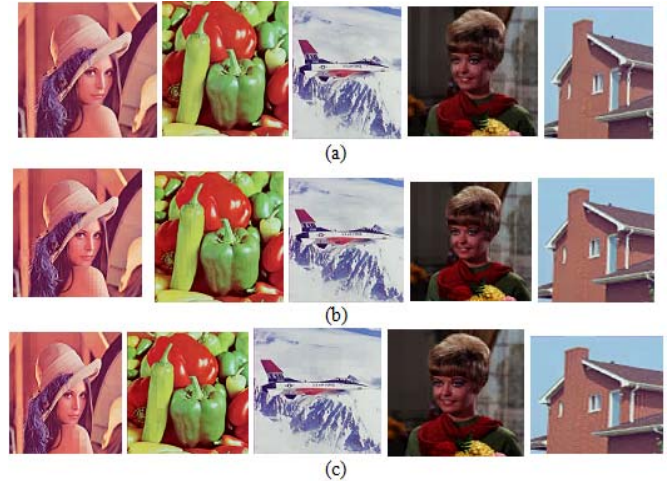
Fig. 5 Compressed images visual performance of the proposed method (A-3): a) DCT block size is 8 \times 8 , b) DCT block size is 16 \times 16 and c) DCT block size is 32 \times 32