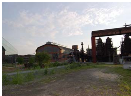
Fig. 7 U6 – Small World Technology

Energy panel is used to manufacture compressed air using two piston blowers weighing together nine hundred tons, which even today are made interesting internal spaces of the building energy exchange. These "lungs smelter" were built in 1938 and in 2012 was converted into a museum called Small World techniques attracting visitors on an interactive tour of the history of technology. Children as well as adults here can try what it is to land a plane or drive a car, pedaling on a stationary bike can warm up the radio and to experience firsthand the production of electricity, they can look at the actual models of production facilities and there waits for them many other activities. The first floor was built viewing terrace from which you can see the entire exhibition together with blowers from above. The tour then continues after technical stairs to the catacombs, where they are installed technical attraction with water and steam. The ground floor of the building can be found, inter alia, refreshments, changing rooms, classrooms and a hall for educational lectures for students and teachers who are here to gain experience of new forms of teaching work undertaken through games, animations and so on. For conversion of energy exchanges stands architectural Studio Z - Helena and Václav Zemánek and architect Zdenek Franek, who participated in the final revised project.