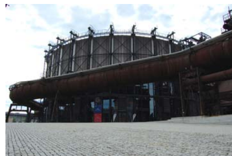
Fig. 6 Gasometer Gong

Gasholder has become a convention center, which seats up to 1500 seats, gallery, restaurant, lounge and locker rooms. In order to achieve this final form, it was necessary to use special construction technology. After the production of the gas tank is empty, the bell remained at a height of one and a half meters inside the entrance featured a hole burned in the mantle of size two times three meters.