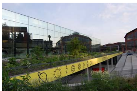
Fig. 4 Mirror glazing

Facade carried out in this way has significantly more plastic character compared to the compress. Individually baked bricks have variable coloring and joints are much deeper, the facade then doesn't caused compact impression.