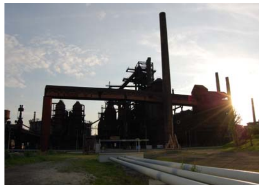
Fig. 1 Vítkovice area

Vítkovice area for the possibility of drawing funds from ministry of culture Integrated Operating Programme and also therefore in the same year there was made a nonprofit organization called Association of Lower Vítkovice area legal entities.