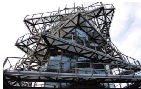
Fig. 5 Extension of the blast furnace

bridge was installed four-ton skip hoist with authentic propulsion engine. The car is in the top glass clear glass and the bottom glass black and is able to take up to sixteen persons. The tower is sixty meters high, allows a unique view of the Lower Vitkovice, and the panorama of Ostrava.