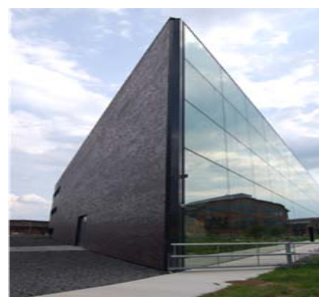
Fig. 2 The corner of The World of Technology