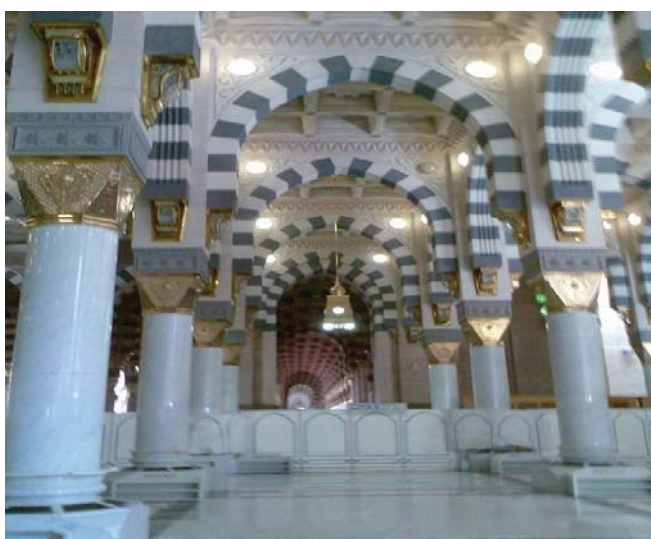
Fig. 2 The internal feature of Al-Nabi Mosque

We should make it clear that Islamic architecture had originated and then its features were inferred accordingly. However, the religious aspect is the most distinctive feature to which Islamic architecture is indebted. It is represented in the Islamic aesthetic mentality.