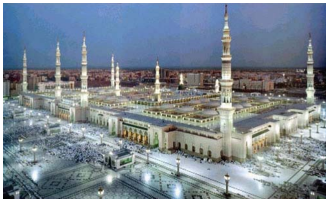
Fig. 1 The feature of Al-Nabi Mosque as the first Islamic construction

to the particular function of the mosque (being a place for worshipping God) but also due what has been mentioned in Koran [13] which has identified a strong and sacred link between architecture and mosque thus making mosque architecture one of the oldest works of Moslems.