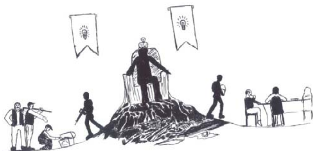
Fig. 3 Sample drawing depicting critique of government policies

In addition to critiques toward Turkey’s agenda, manifestation of pan-Turkism, a movement that supports political and cultural unification of all Turkic people, and nationalist ideologies attracted the attention. Turkey was represented within the national borders, and the view that “Turkey belongs to the (pure) Turks” was stressed. Moreover, Turkic republics were represented within the boundaries of Turkey that implied pan-Turkist ideas. On the one hand, existing national borders symbolizes modernism, on the other hand including Turkic republics within the borders falls behind the modernist stance.