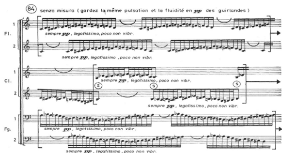
Fig. 2 Part I, no 76, p. 32

repetitive phenomenon that has a strategic importance in the general economy of the opus.