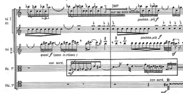
Fig. 7 (a) Part I, no 32-33, p. 18

But the modal monody of parlando-rubato type has the generating impulse of multiplicity. Being reflected in a polyphonic-heterogeneous multi-ocality, the monodic line is often branched into heterophonic sounds, those 'gaps' (desynchronisations) preceding or following the intersection in unison being brought by the hetero-rhythmic mobility (B flat – B natural – C – C sharp etc.).