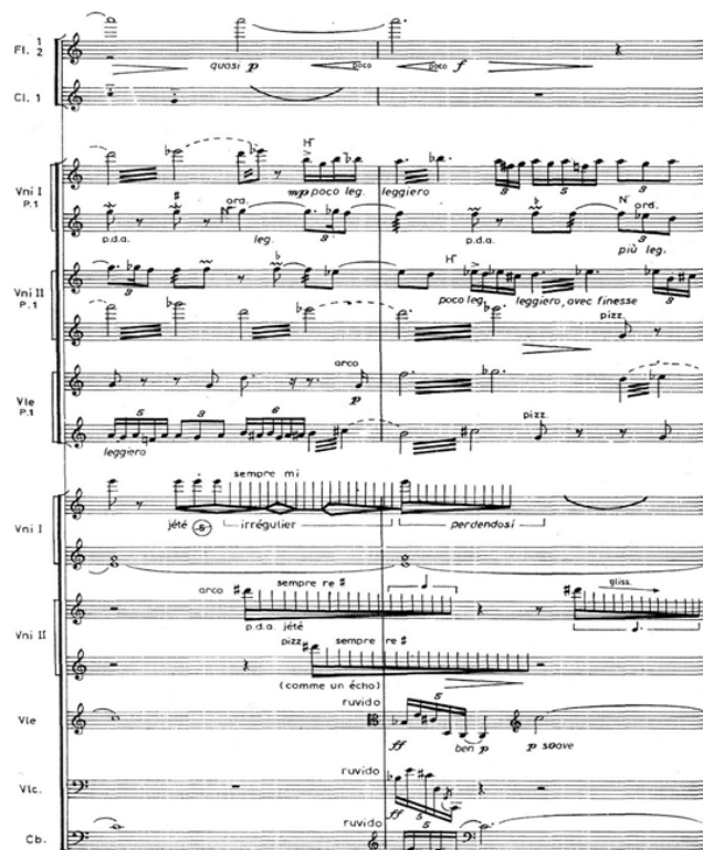
Fig. 4 Part I, no 53, p. 25

The cult for this ancient form of expression – symbolic representation of philosophical essence of the ONE, as opposable term for the MULTIPLE – will determine the music composer to open The Concert with an exceptional modal monody entrusted to the solo (baritone) saxophone.