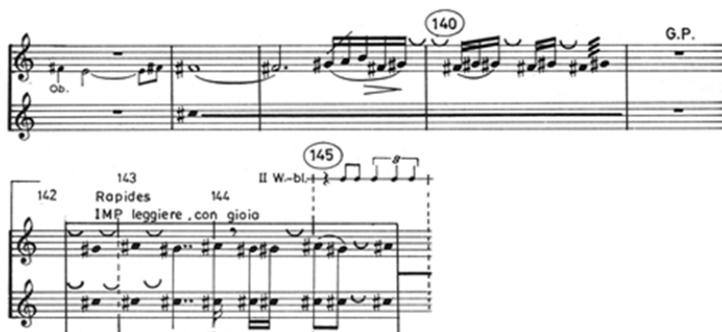
Fig. 8 (b) Part III, no 138-145, p. 103