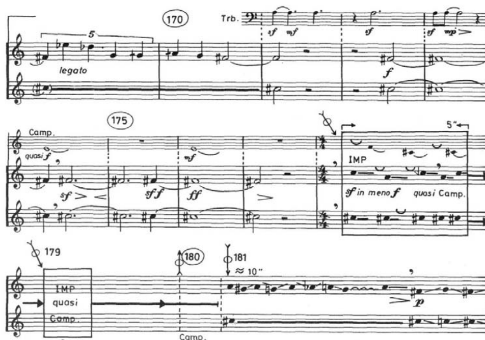
Fig. 8 (d) Part III, no 181-182, p. 107

This distinctive phase of the work potentiates to the maximum the soloistic score, opening unexpected insights regarding the bi- (and multivocal) writing designed for this instrument. Also, the intertwining of the two voices – governed by the complementary static (accompaniment) – mobile (melody) ratio – brings back into the foreground all the