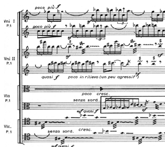
Fig. 7 (b) Part I, no 34-35, p. 19