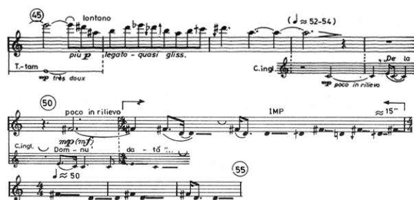
Fig. 6 (b) Part III, no 45-55, pp. 89-90, sax. alto