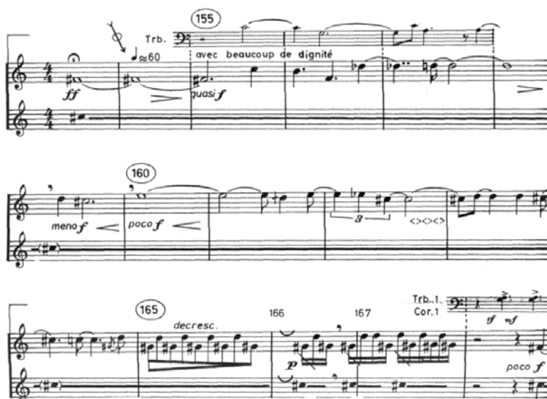
Fig. 8 (c) Part III, no 163-171, pp. 105-106