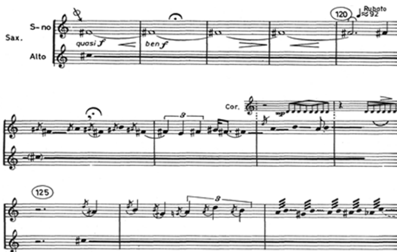
Fig. 8 (a) Part III, no 118-127, p. 101

when, on a significant expansion of Part III (no 116-210, pp. 101-112), he plays two saxophones simultaneously ( sopranino and alto ).