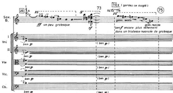
Fig. 3 Part I, no 84, p. 36

Fig. 3 excerpt represents an ostinato surface with a global effect, whose multi-vocal density draws a very fine border between heterophony and mobile cluster. Initiated in a state of rarefaction (no 78, p. 33) and progressively crowded (no 84, p. 36), this fluid sound mass will accompany the entire soloistic evolution of the baritone saxophone, in the widest evolution of multiphonics (no 84-87, pp. 36-41).