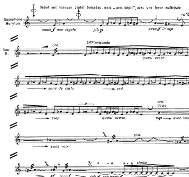
Fig. 5 Debut of The Concert , p. 5

We see here the entire arsenal of the means of expression in a parlando-rubato manner: melisma sinuosity with a variable