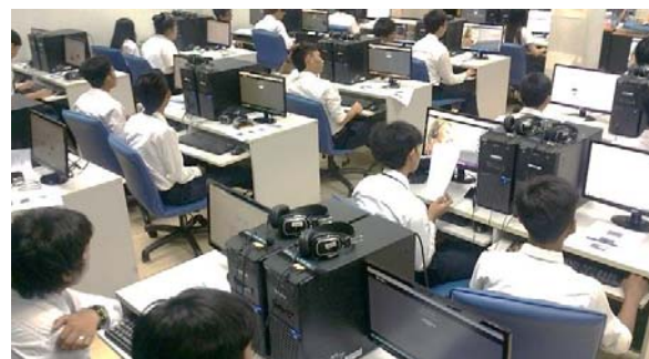
Fig. 3 Thai Students participation on the training program