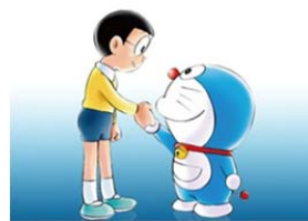
Fig. 5 Left: Nobita, and right: Doraemon

Images of the paper are used from the related websites of Doraemon, etc.