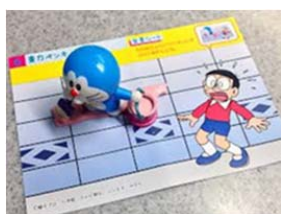
Fig. 3 Gravity painting

Doraemon also explains Einstein's theory of relativism [7]. When Nobita went to Suneo's house, he saw a science fiction movie about an astronaut who returned from the space travel for a year, but actually fifty years have passed. Nobita asks why the pilot spent only a year instead of fifty years. Suneo answered, "the closer the motion of an objects get to the speed of light, the slower the time passes. It is called relativism." In other words, time passes slower in the rocket. Then Shizuka explained relativism using Urashima's story. "It is like an old Japanese story about Urashima. When Taro returns from Ryugujiyo for three days, he returns home, but it actually passed three hundred years had passed. It is like a space travel. The one who helps Taro is a tortoise-like alien (in the story, tortoise), and with a tortoise rocket (a tortoise) takes Taro to a wonderful star, Ryugujiyo." "Eight days in Ryugujiyo" (Ryugujiyono Hachinichikan) [8].