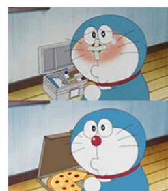
Fig. 4 Upper original version: Doraemon with a bandage on his face, and lower US version: pizza