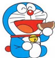
Fig. 2 Doremon eating his favorite sweet bean cake

Fujiko F. Fujio (Doraemon's creator, a penname of Fujimoto Hiroshi.) decided on different storylines for different ages of children in the six magazines, e.g., different interesting secret gadgets for 7 and 8 years old children, Nobita's spiritual development for 9 and 10 years old and environmental issues for 11 and 12 years old. Fujiko used the different themes which were appropriate to the ages and education levels of the children. He used many societal themes such as global warming, endangered species, homeless animals, pollution, and deforestation.