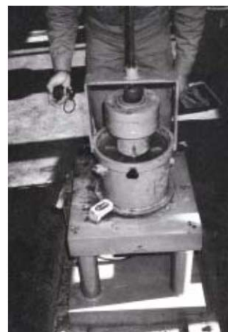
Fig 2 VC Meter

RCC layers thicknesses can be up to 600 mm. For preventing the cold joint, placement of concrete operation should be continuous and for this reason the selection of plant is very important due to its capacity and distance to project [1]. The thinner or thicker layers have to optimize to get the best result. The thinner layer enables joints to be covered faster by better bonding. The thicker layer subjected to more seepage paths owing to weak joint bond. Thinner layer is usually use for small job and thicker layer for larger job. The minimum number for suitable compaction by roller machine to get the best compaction has been specific by mix design, the layer thickness and the type of compactor. The most important item which controls the compaction requirements is layer thickness. The layer thicknesses normally selected between 150 and 900 mm. By increasing the number of passing, the density of RCC decrease and for this reason in the US 300 mm has been selected for thicknesses of layers. For transition the concrete conveyors can be used and constructor can continue in the moist weather. For using this method degradation of water in the mixture is necessary due to high humidity and nonexistence of surface drying [3]. Compaction energy is also an important factor in determining the strength of RCC. So the consistency of RCC mixture was measured with the VC meter shown in Fig. 2 [5].